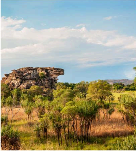
Australia's tropical north, Kakadu, NT

There is a close link between climate and vegetation. These photographs show the landscape and are vegetation typical of each climate zone.