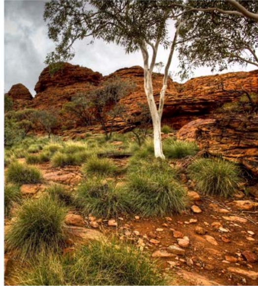
Australia's semi-arid north