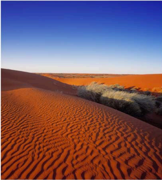
Australia's arid centre, Simpson Desert