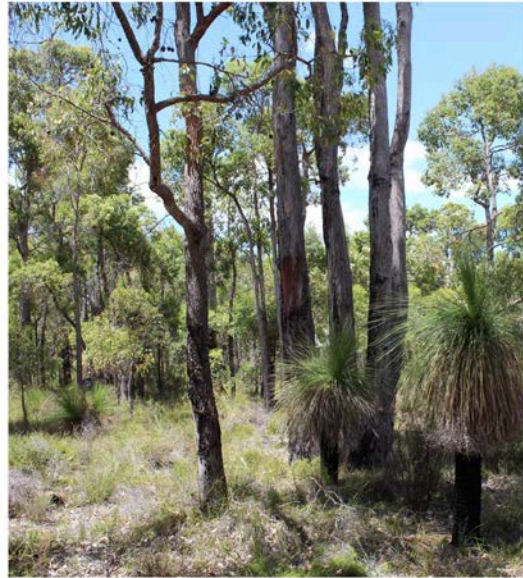
Western Australia's Mediterranean landscape