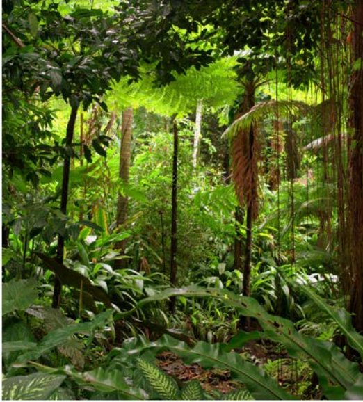
Sub-tropical climates, North Queensland rainforest